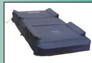
Available with raised side rails