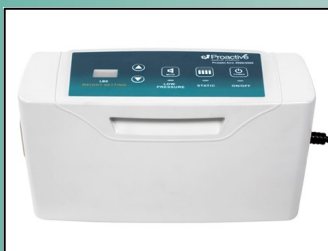
Simplified Digital Pump