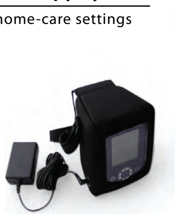
Battery Charger and carrying bag included