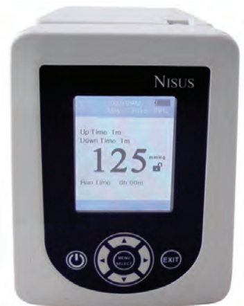
Powerful and Portable