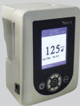
KMS Nisus 1000 Pump HCPCS Code E2402, 2-Year Warranty