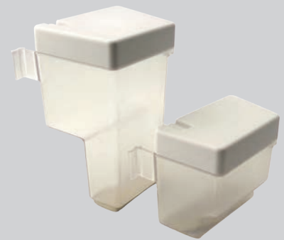
Canisters (250 mL & 500 mL) HCPCS Code A7000